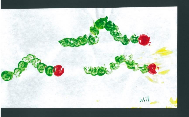
Two of Will's work of the week.