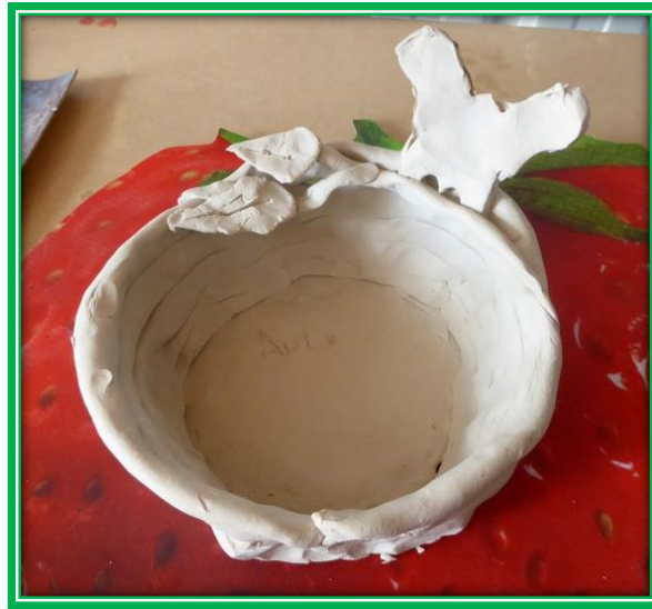
Abby's Work of the week